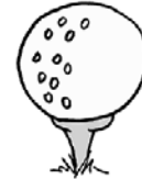
From The Red Tees

Lastly, please don't forget the card party was moved to January 20th. If you are interested in reserving a table please call Carol Chvilicek or Karen Graybeal.